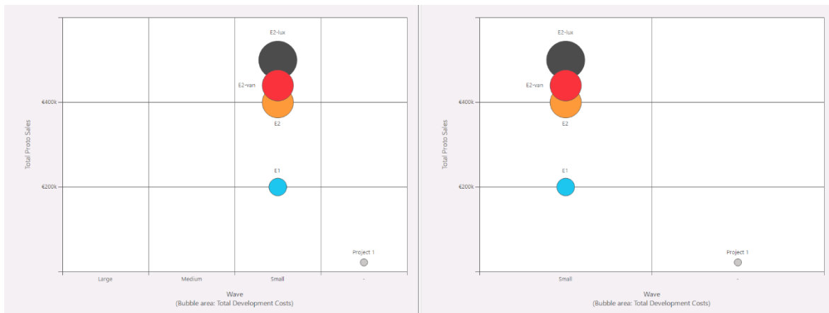
Figure 1: Show or hide unused groups